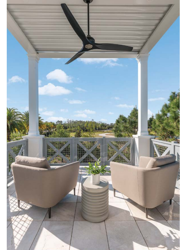
ABOVE: One of two balconies accessible from the primary suite, this breezy seating area boasts splendid golf-course views. A motorized louvered pergola from StruXure allows adjustable covering overhead, and a pair of Zumba club chairs from JANUS et Cie provides a cozy spot for a nightcap.

When planning this home, the gazebo floating over the pool and the rooftop (fireworks-viewing) terrace spark memories of Kean's favorite spots. "I also enjoy the story that unfolded when selecting the globe water feature at the front that inspired the name The