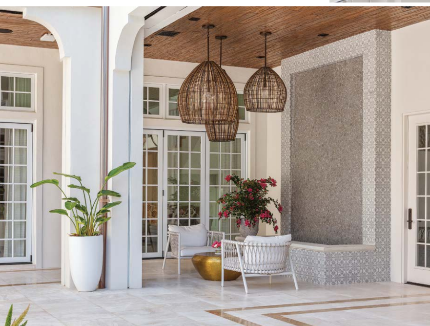
LEFT: A tiled fountain feature punctuates a tranquil alfresco seating area covered with a tongue-and-groove ceiling by Beth Construction. Pendant lights from Troy Lighting hang above a pair of Brown Jordan Oscar lounge chairs.