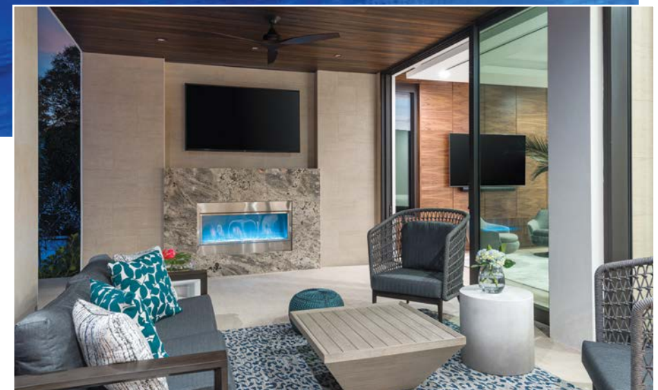
RIGHT: The owners wanted a private seating area with TV and fireplace just outside the master bedroom—where George lounges in the hot tub most evenings and Jamie watches TV with their dog, London.

“There are no hard corners and nothing is stark white; it’s all soft, creamy colors with lots of texture and warm wood,” Miller says. Jamie specified furniture that could be lived on, so Miller installed durable performance fabric. “You could