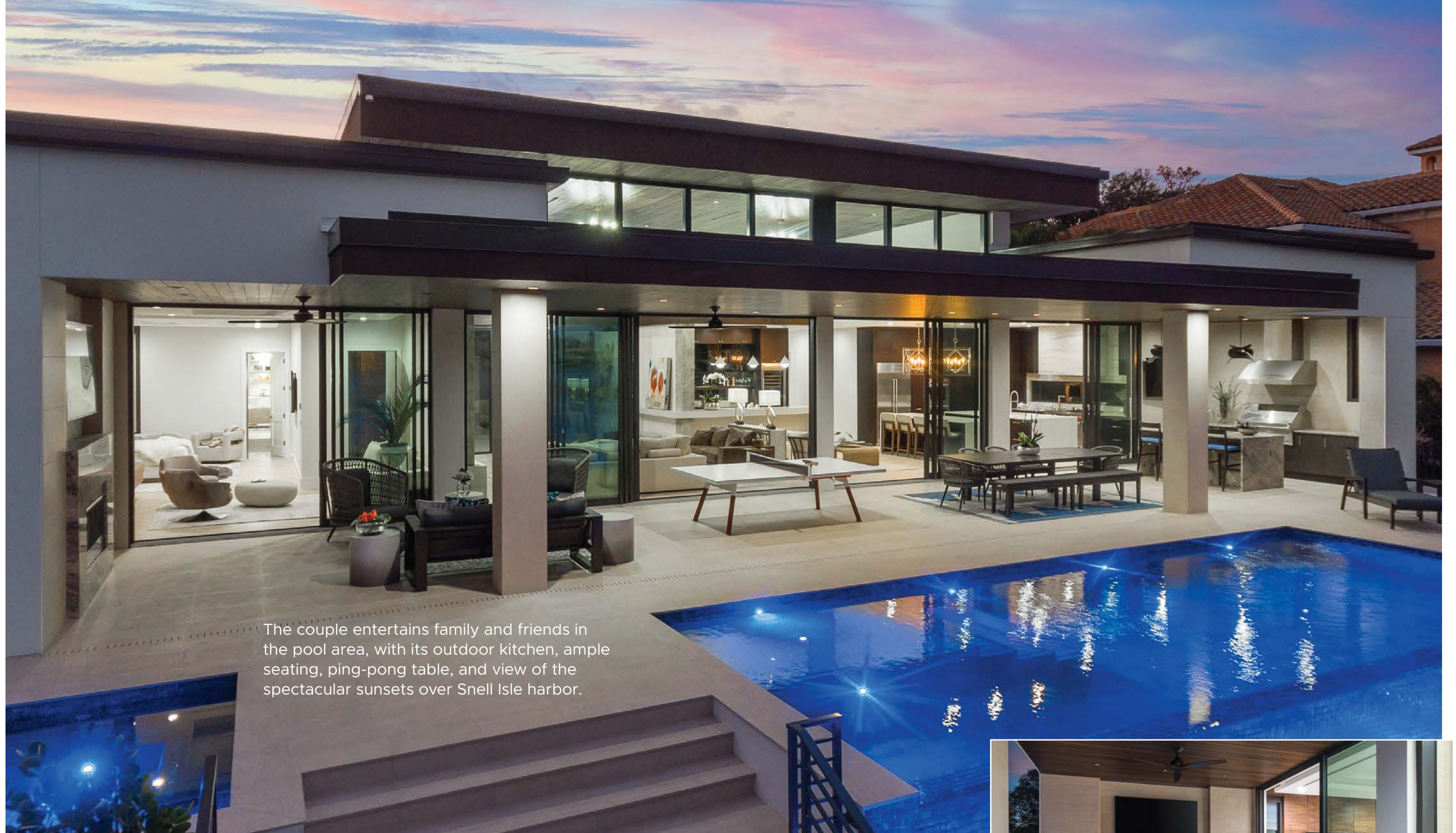
The couple entertains family and friends in the pool area, with its outdoor kitchen, ample seating, ping-pong table, and view of the spectacular sunsets over Snell Isle harbor.

upholstered in plush, spill-proof fabrics. She describes the new design as “soft contemporary-glam,” and says that although the Lutiches are empty-nesters, they often entertain friends and family (all three of their grown children live within a mile) and want people to feel welcome and comfortable.